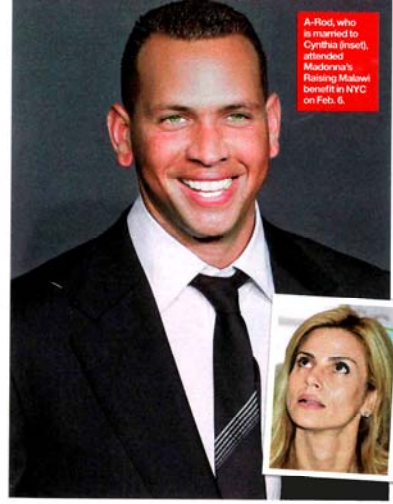
A-Rod, who is married to Cynthiah (inset), attended Madonna's Raising Malawi benefit in NYC on Feb. 6.