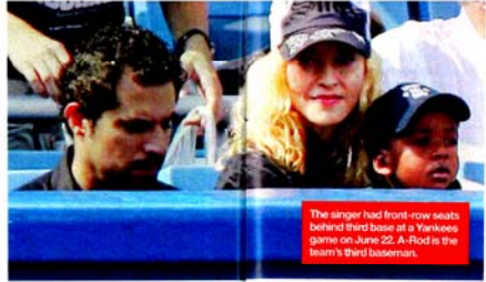
The singer had front-row seats behind third base at a Yankees game on June 22. A-Rod is the team's third baseman.